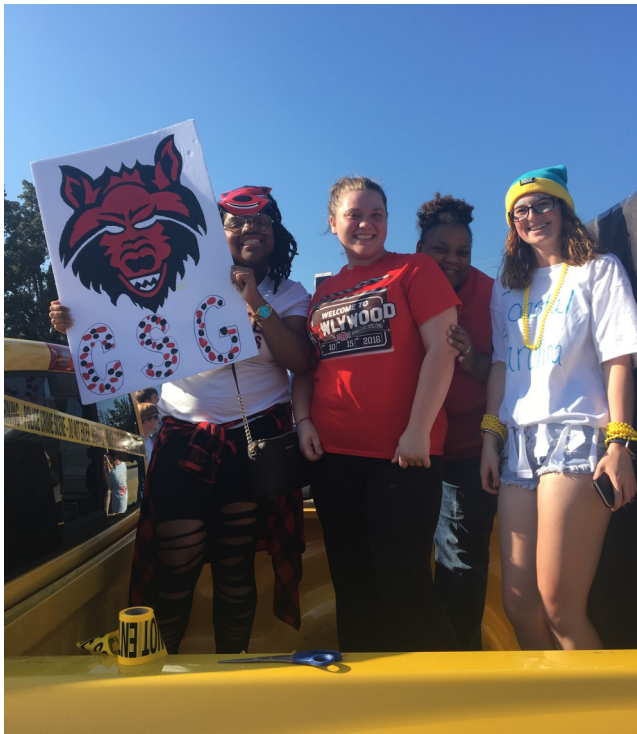
Left: CSG members participating in homecoming week 2017